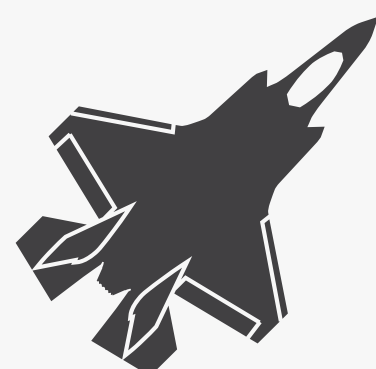
F-35 Sustainment Operations

Ohio is home to the development and production of several Lockheed Martin key mission portfolios, to include: